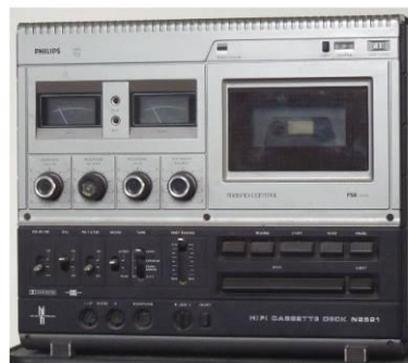
Philips Hi-Fi Cassette Deck from 1977

popular model in Staff Shop It worked very well