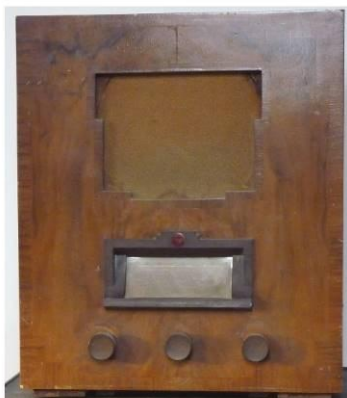
Philips 838HU from 1934

A superinductance TRF set for AC/DC mains