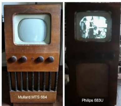
Philips 683U TV from 1949

Next to it is Mullard MTS 684 The sets use the same chassis Picture tube is 9" The 683U has been restored