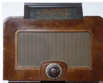
Mullard MAS 8 from 1937