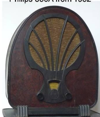
Philips 830A from 1932

TRF without regeneration SUPER INDUCTANCE Medium & Long Wave Made in England