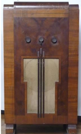
Philips 587U from 1935

popular model in Staff Shop It worked very well